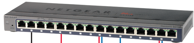
ProSafe Plus Switch 16-port Gigabit Ethernet (GS116E)